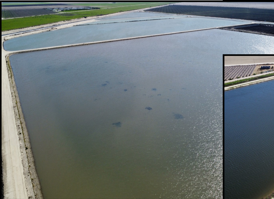
K Basin Dual Use Solar/Recharge Complex