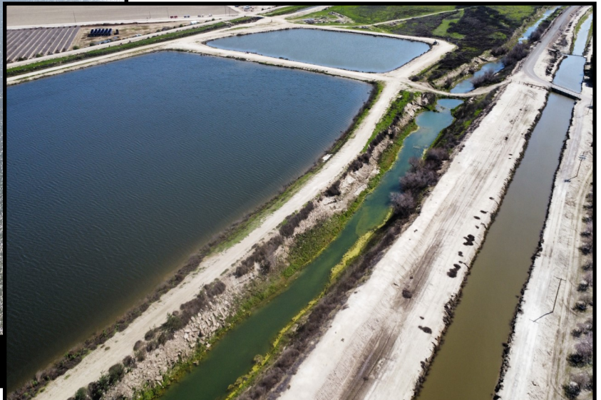
Floral Avenue Basin Complex