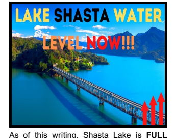
(within 2-3 feet from the top). The water level rose nearly 100 feet since January 1 & has reached the tree line.

SUPERINTENDENT Kenneth Mancini (559) 829-8410 kmancini@jamesid.org