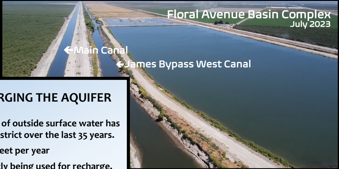
Floral Avenue Basin Complex July 2023