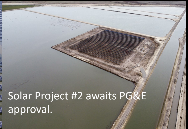
Solar Project #2 awaits PG&E approval.