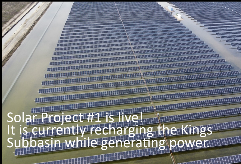
Solar Project #1 is live! It is currently recharging the Kings Subbasin while generating power.