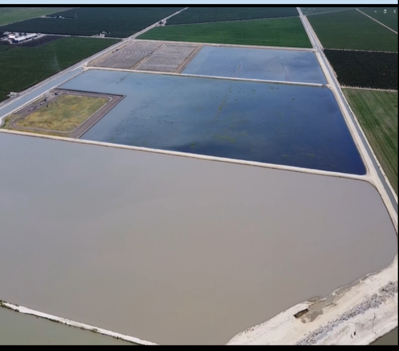
Lateral K Recharge Basin including Solar Projects 1 & 2. When completed, solar fields will be flooded for recharge, serving a dual purpose. - June, 2023