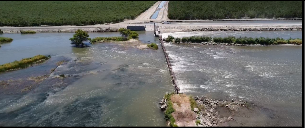
Kings River flood releases from Pine Flat Dam flowing west through the James Weir are diverted into the District's Main Canal for irrigation & recharge. Excess flows continue west toward Tranquillity Irrigation District & into the Mendota Pool. - June, 2023