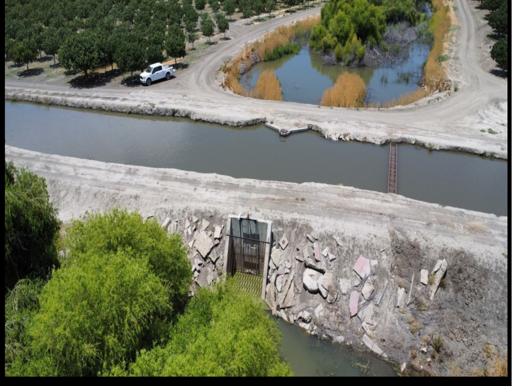
Mud Dam - June, 2023